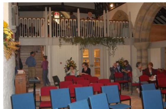
Living History October 2010

So, after a closure of nine months, the 're-ordered' church held its first service, - Harvest Festival, on Sunday 20^{\text{th}} September and the new Shop and Post Office opened on Thursday 1^{\text{st}} October 2009.