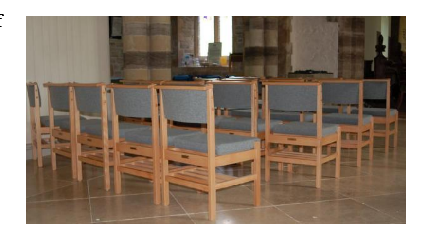
Compiled by Ian Mortimer (October 2012)

As part of the re-ordering of the church in 2009, the Victorian pews were removed to be replaced by modern comfortable chairs each paid for by a donation of £50 and each chair having its own individual brass plate.