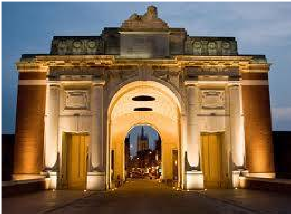
The Ypres Memorial, Belgium

He is commemorated on the Menin Gate Memorial at Ypres.