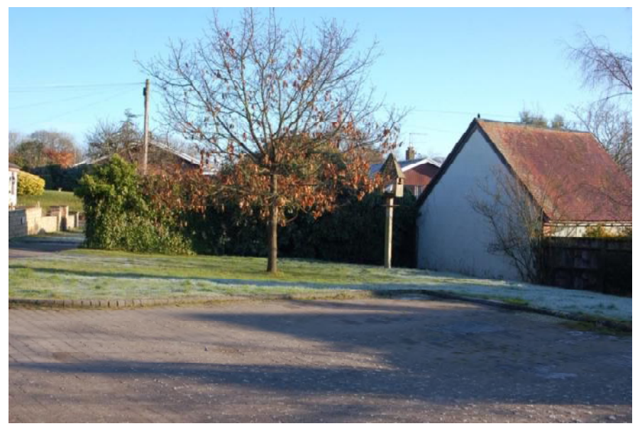
Compiled by Ian Mortimer (April 2015)

Garages are located behind the development. Landscaping included the planting of indigenous trees and the use of antique brick paviors and kerbstones in the courtyard.